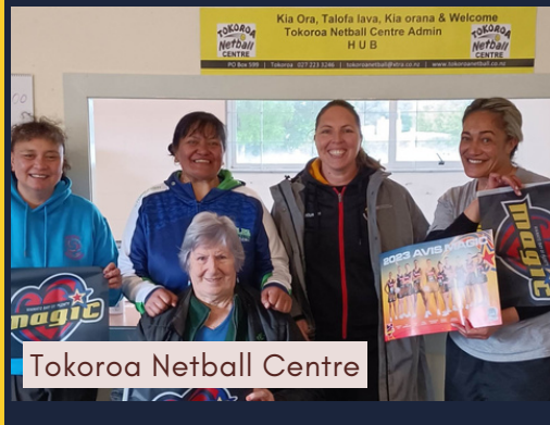
Tokoroa Netball Centre