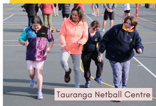
Tauranga Netball Centre