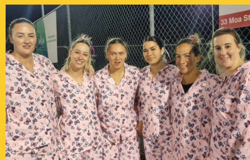
Maniapoto Netball Centre

We love to visit and hear about futureFERNs fun days and festival days across the WBOP Zone, and loads of Centres have been running fun and vibrant junior netball events. These snaps from Manawa Energy Taumarunui Netball Centre showed such fun (and made us grin so much) that we had to share em.