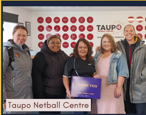
Taupo Netball Centre