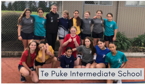
Te Puke Intermediate School