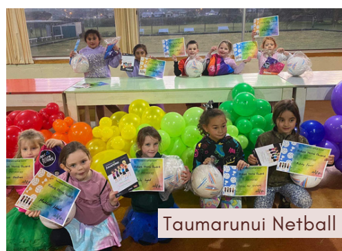
Taumarunui Netball Centre