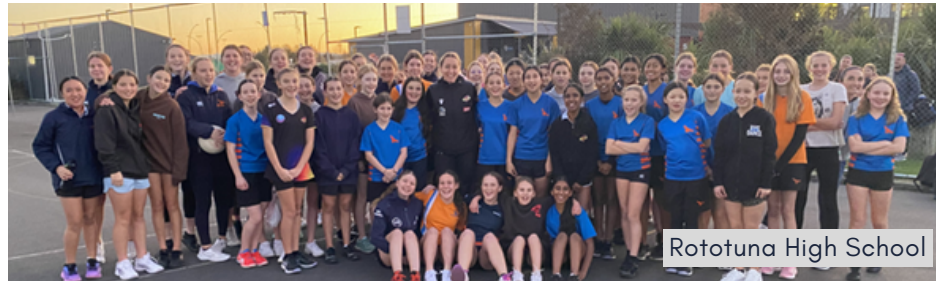
Rototuna High School