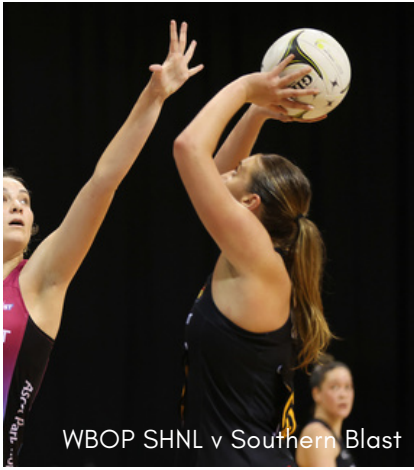
WBOP SHNL v Southern Blast