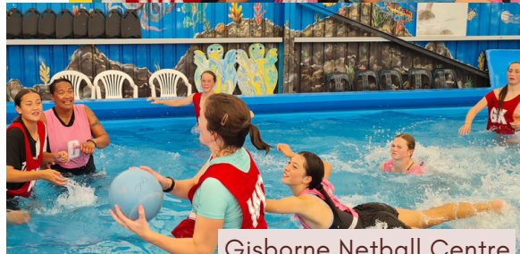
Gisborne Netball Centre