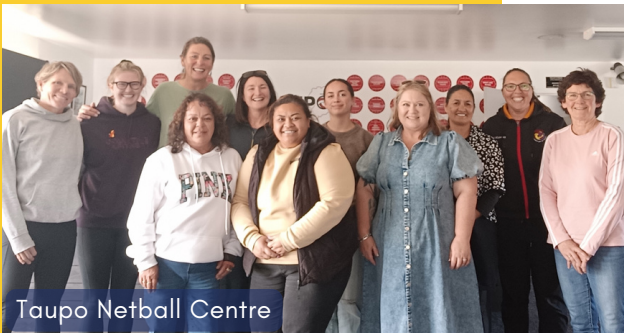
Taupo Netball Centre