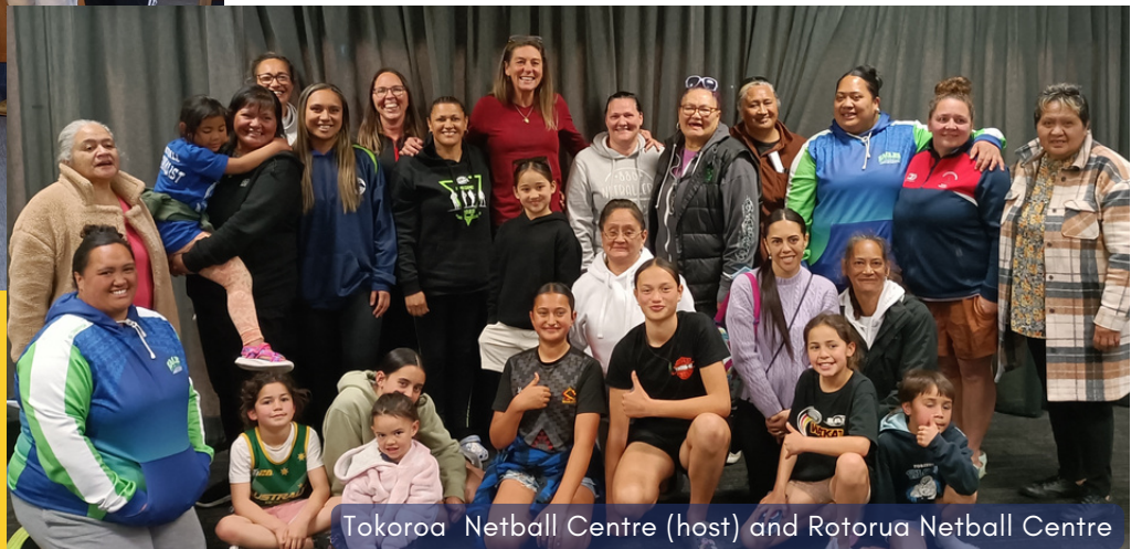
Tokoroa Netball Centre (host) and Rotorua Netball Centre