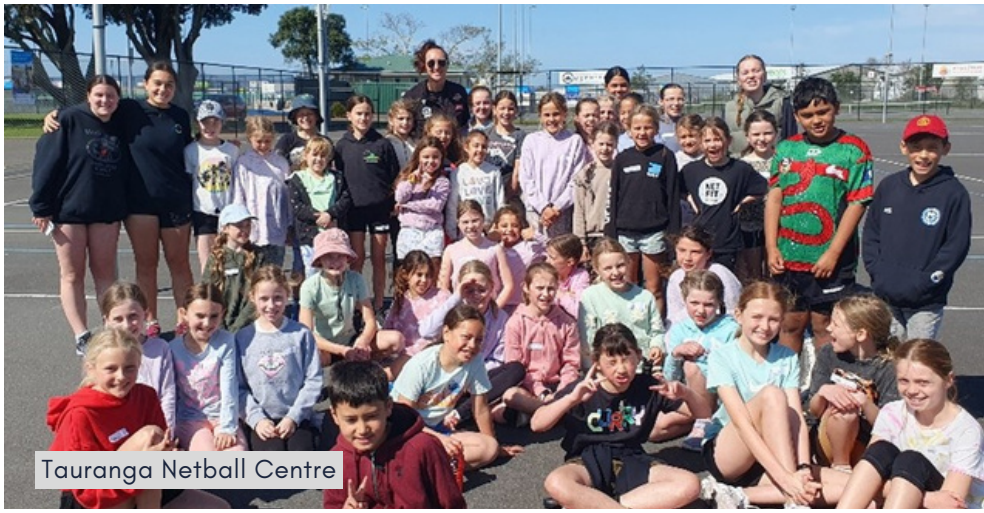
Tauranga Netball Centre