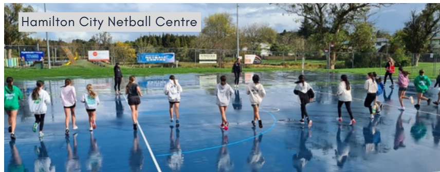
Hamilton City Netball Centre