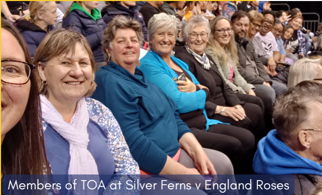
Members of TOA at Silver Ferns v England Roses