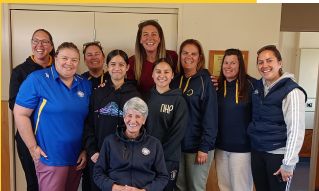
Whakatane Netball Centre (host) and Tauranga Netball Centre