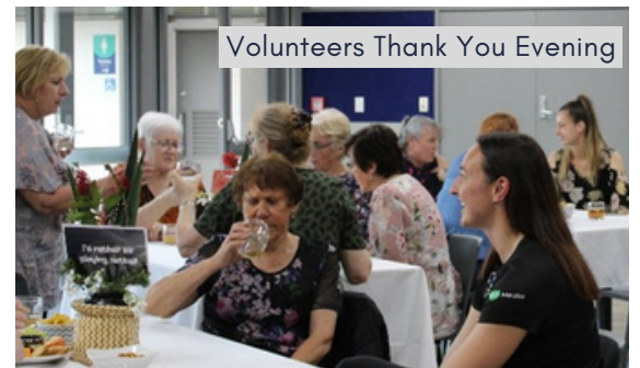
Volunteers Thank You Evening