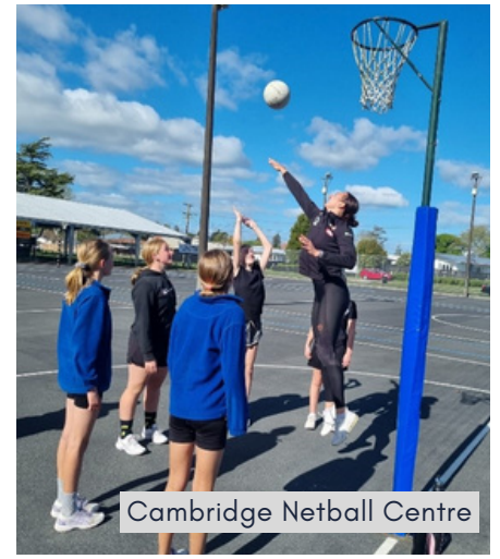
Cambridge Netball Centre