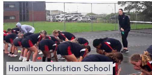
Hamilton Christian School